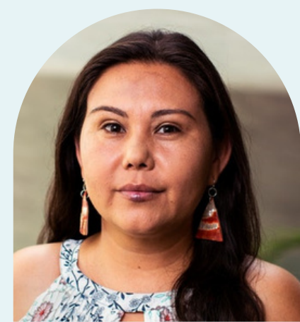
MORNING STAR GALI

Protecting sacred sites for indigenous communities and uplifting the voices of California's indigenous peoples.